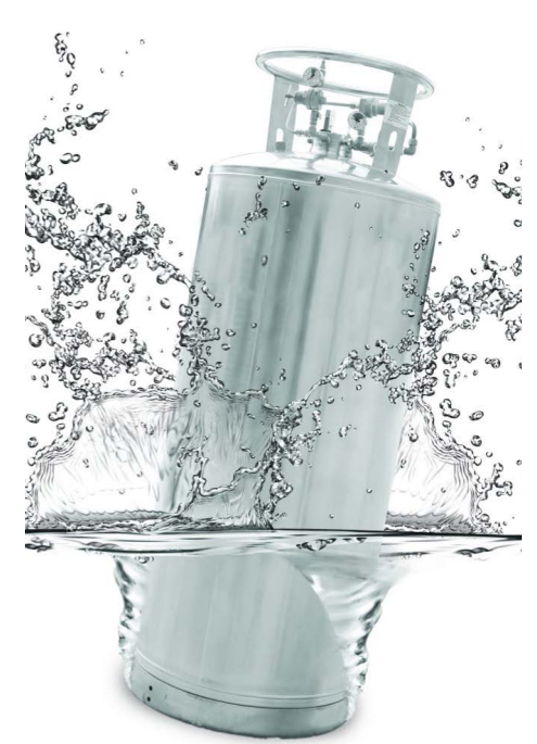
and other high purity applications